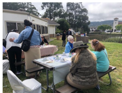
RLS members at the Anniversary Tea; see page 3