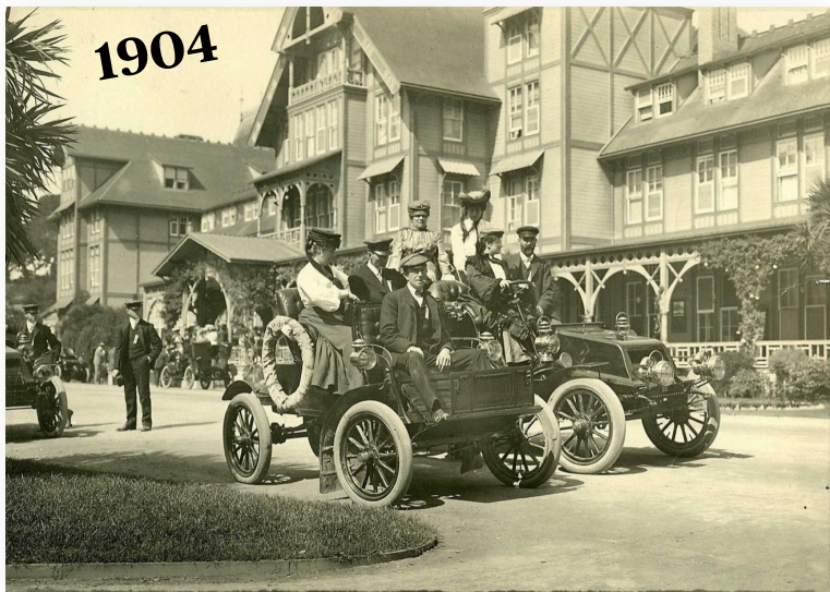
Autoists gather at Hotel Del Monte, 1904